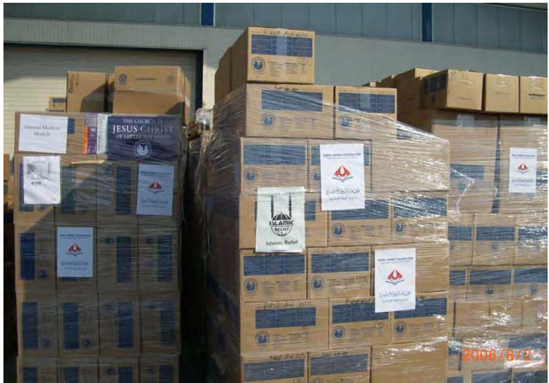
Shown at the Cyprus airfield is part of the August 1, 2006 air shipment of relief supplies before transport to Beirut via Swift boat, courtesy of the U.S. Navy.

For the second and much larger shipment – 156 tons – HF-USA donated half of the airfreight cost for the September 8 flight from the U.S. to Lebanon. This major shipment contained many millions of dollars worth of relief supplies which were donated by the following organizations: the DC Chapter of the American