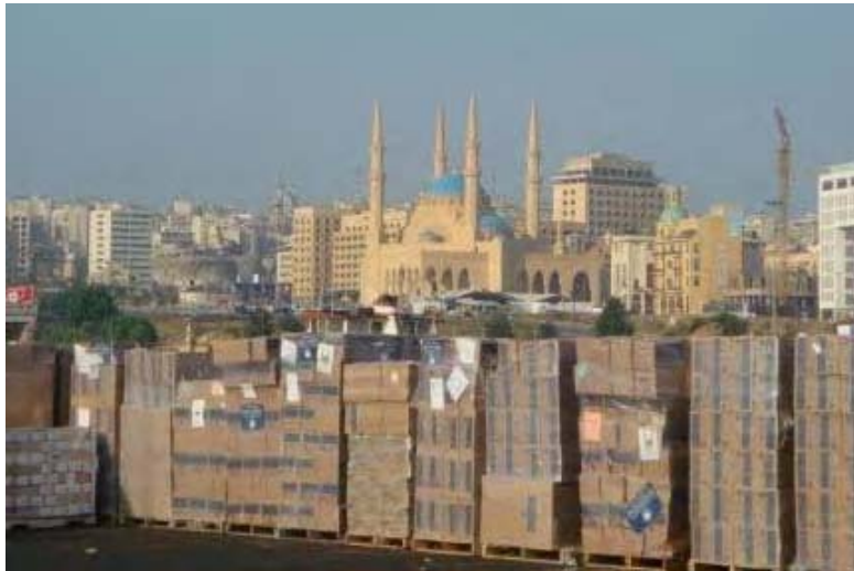
A large part of the second shipment of relief supplies after being unloaded in the port of Beirut. .