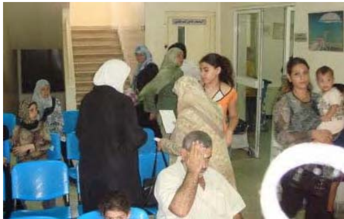
Displaced Lebanese seeking medical treatment at the Tareek Al-Jadeeda clinic, the main Hariri Foundation medical center in Beirut.

USA to provide vitally needed relief aid to Lebanon in the form of medical supplies and equipment, food, water, clothing, blankets, and temporary shelter.