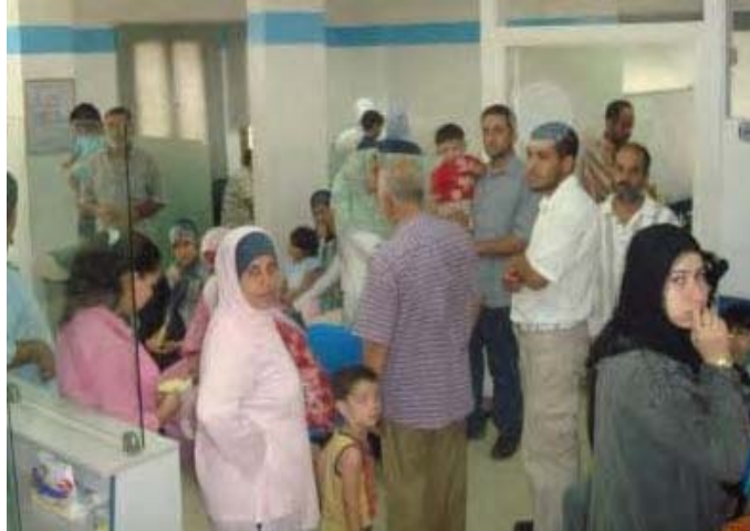
Displaced Lebanese seeking medical treatment at the Hariri Clinic in Ein Al-Hilwe, the main Hariri Foundation medical center in South Lebanon.

The outpouring of generosity in response to this appeal was overwhelming and enabled HF-