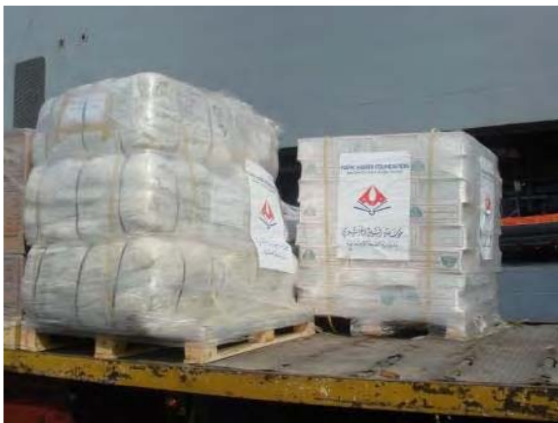
Part of the first shipment of relief supplies for the Hariri Foundation after being unloaded in the port of Beirut in August 2006

destruction in Lebanon which the world witnessed moved many other non-profit organizations to mobilize for relief activities and to undertake joint relief efforts with like-minded organizations.