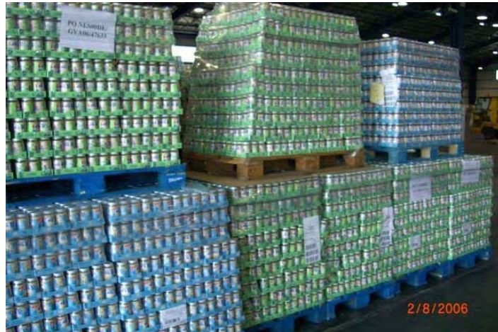
Part of the August 1, 2006 shipment of relief supplies: pallets of baby food awaiting transport by sea from Cyprus to Beirut.

Among the recipients of these relief supplies were the Ministry of Health of Lebanon, the Rafik Hariri Foundation Directorate of Health and Human Services, Catholic Relief Services, Charities of the Maronite Church, the International Medical Corps, and the Free Evangelical Association.